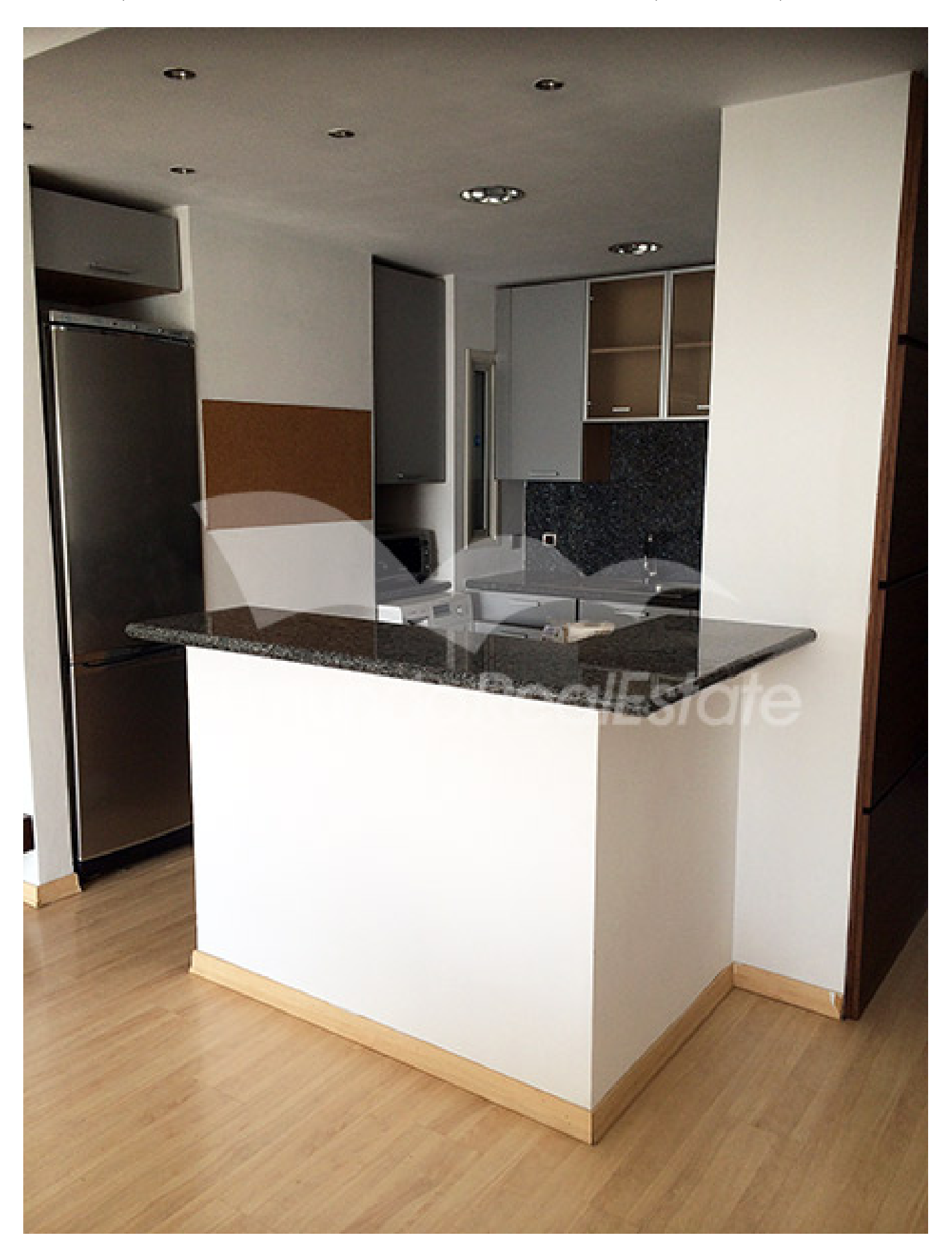
879, HIGH QUALITY 2 BEDROOM APARTMENT IN ACROPOLIS, ID 879 225,000 EUR